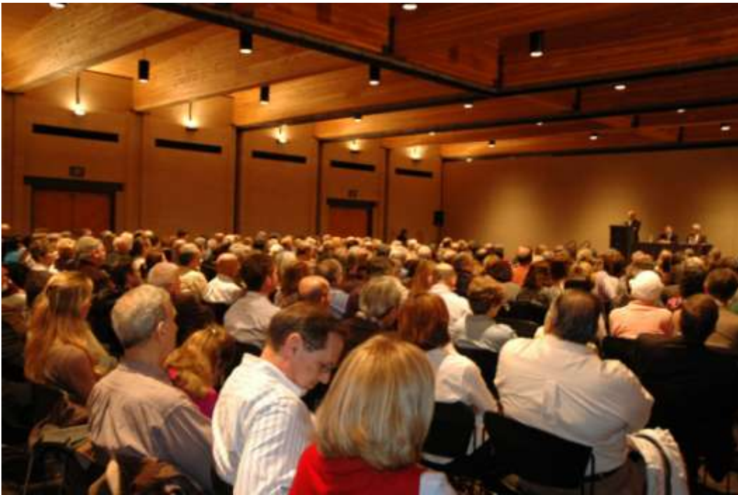
Attendants at Briefing on Middle East Peace Process